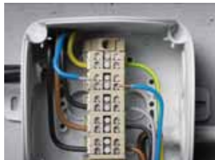
para condutores de Alumínio