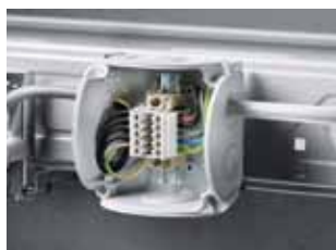
com ligadores em série