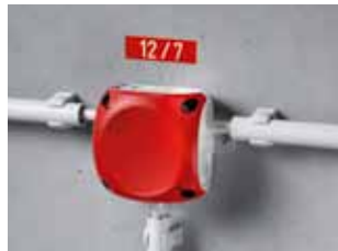
para iluminação de segurança