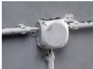
para condutores de Cobre