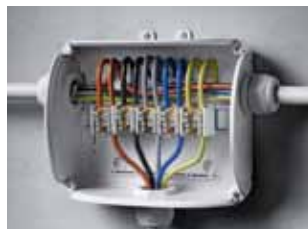
com ligador para derivação da linha principal