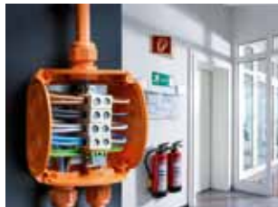
com integridade de isolamento e funcional